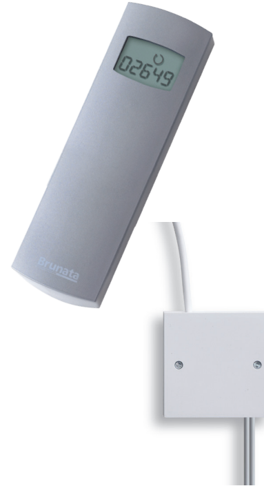
Brunata's electronic pulse collector

Please state system number when contacting Brunata