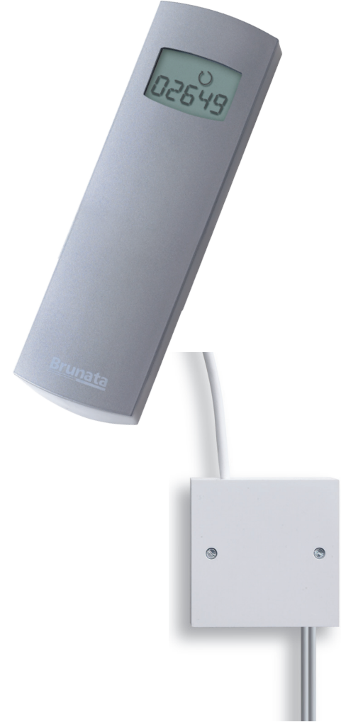
Brunatas elektroniske pulsopsamler